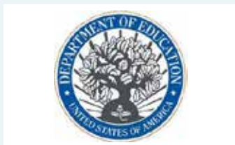
U.S. Department of Education