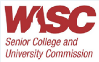
WASC Senior College and University Commission