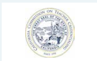
California Commission on Teacher Credentialing