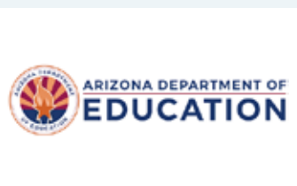
Arizona State Board of Education.