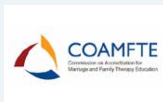
Commission on Accreditation for Marriage and Family Therapy Education